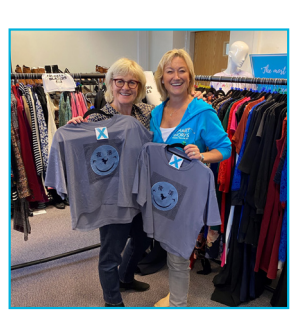
Attend one of our Fashion Sales