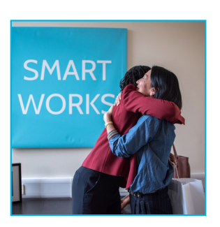
Donate via our website